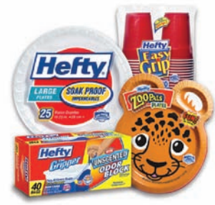
disposable tableware & waste bags