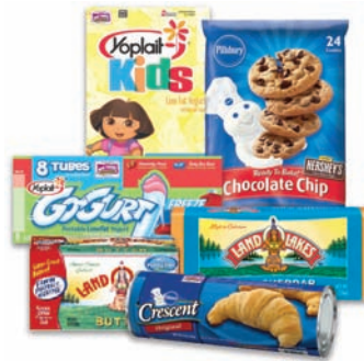
refrigerated & dairy