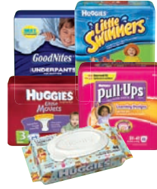
baby & child care