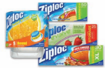
storage bags & containers