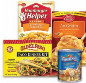
meals & sides