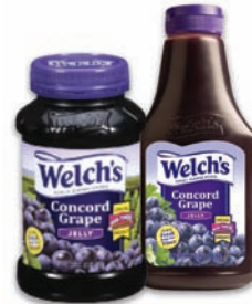
jams, jellies & spreads