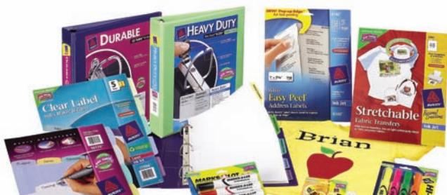
school & office supplies

Visit www.btf.com/products for a complete list of participating Box Tops products